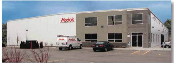
The Madok plant in Brantford, Ontario

Each HERESITE® corrosion protection solution is a combination of a superior coating product - proven over years of use in the field across a wide variety of the most demanding operating environments – that can be tailored to meet the unique requirements of specific industry applications, AND Madok's consistently superior level of customer service that produces unsurpassed customer benefits.